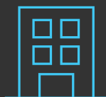
Microsoft 365 Business

Together, Microsoft and Cobweb are in a unique position to help companies empower their employees, unlocking business growth and innovation.